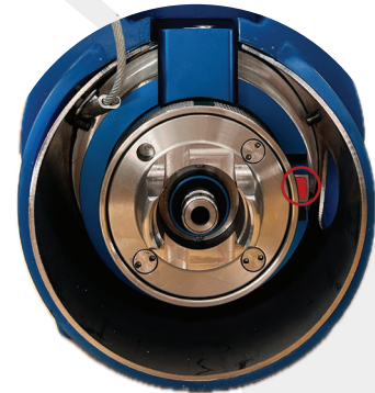
Source Assembly locking mechanism is released and ready to expose