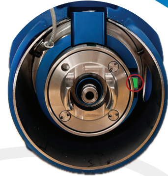
Source Assembly is in the secured position.